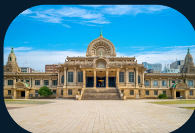
Tsukiji Hongan Ji