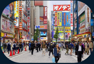
Akihabara Electric Town