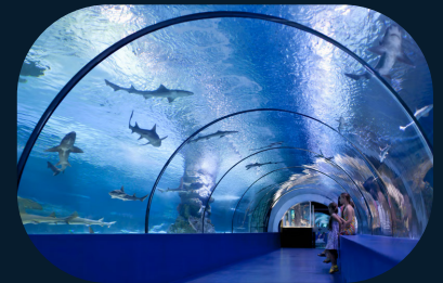
Osaka Aquarium Kaiyukan